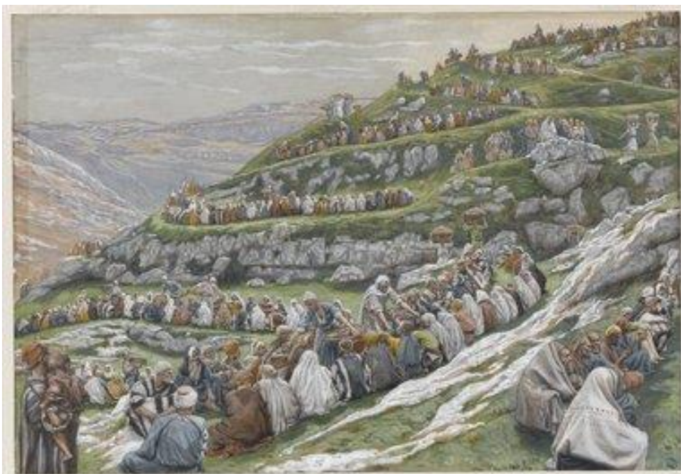
The Miracle of the Loaves and Fishes (La multiplication des pains), 1886–1896, James Tissot