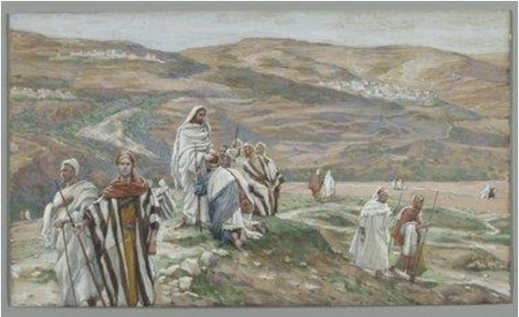
He Sent them out Two by Two (Il les envoya deux à deux), 1886–1896, James Tissot