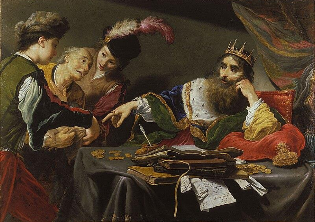
Parable of the Unforgiving Servant, Claude Vignon 1659

The Sixteenth Sunday after Pentecost September 17, 2023