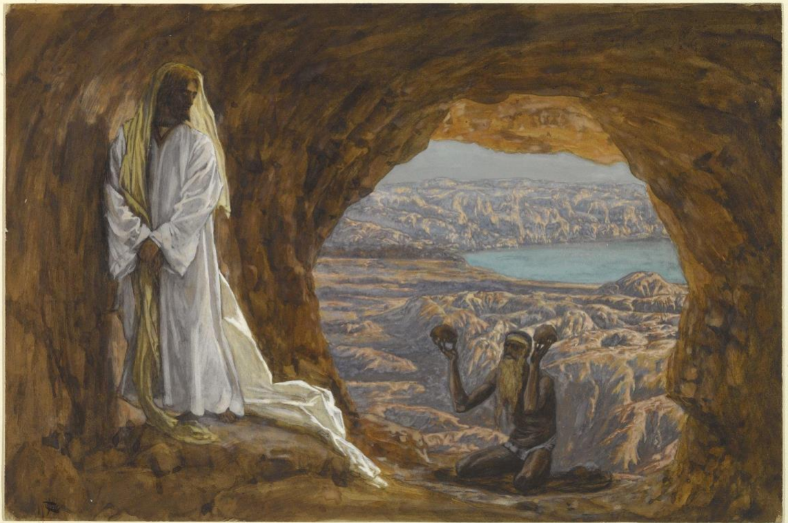
Jesus Tempted in the Wilderness (Jésus tenté dans le désert), 1886–1894, James Tissot