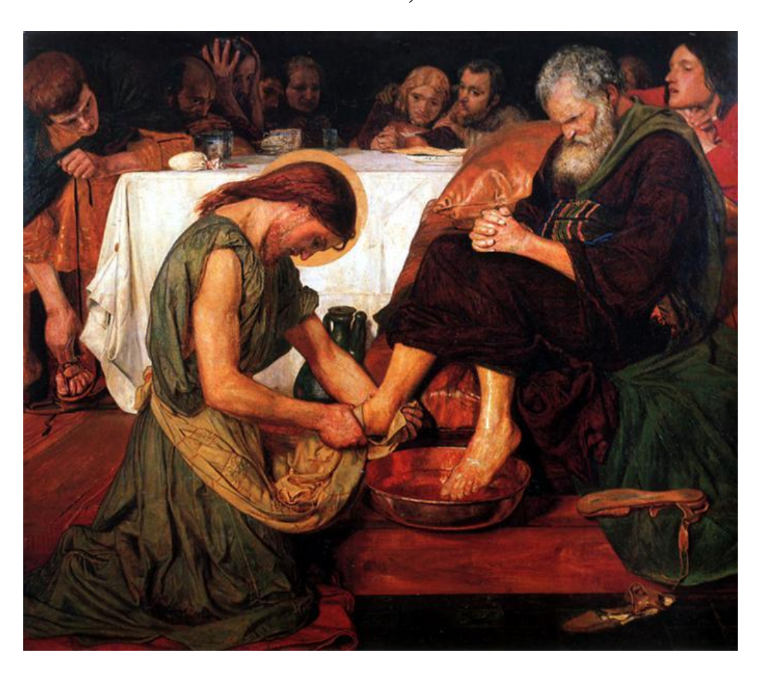
Jesus washing Peter's feet, Ford Maddox Brown, 1876