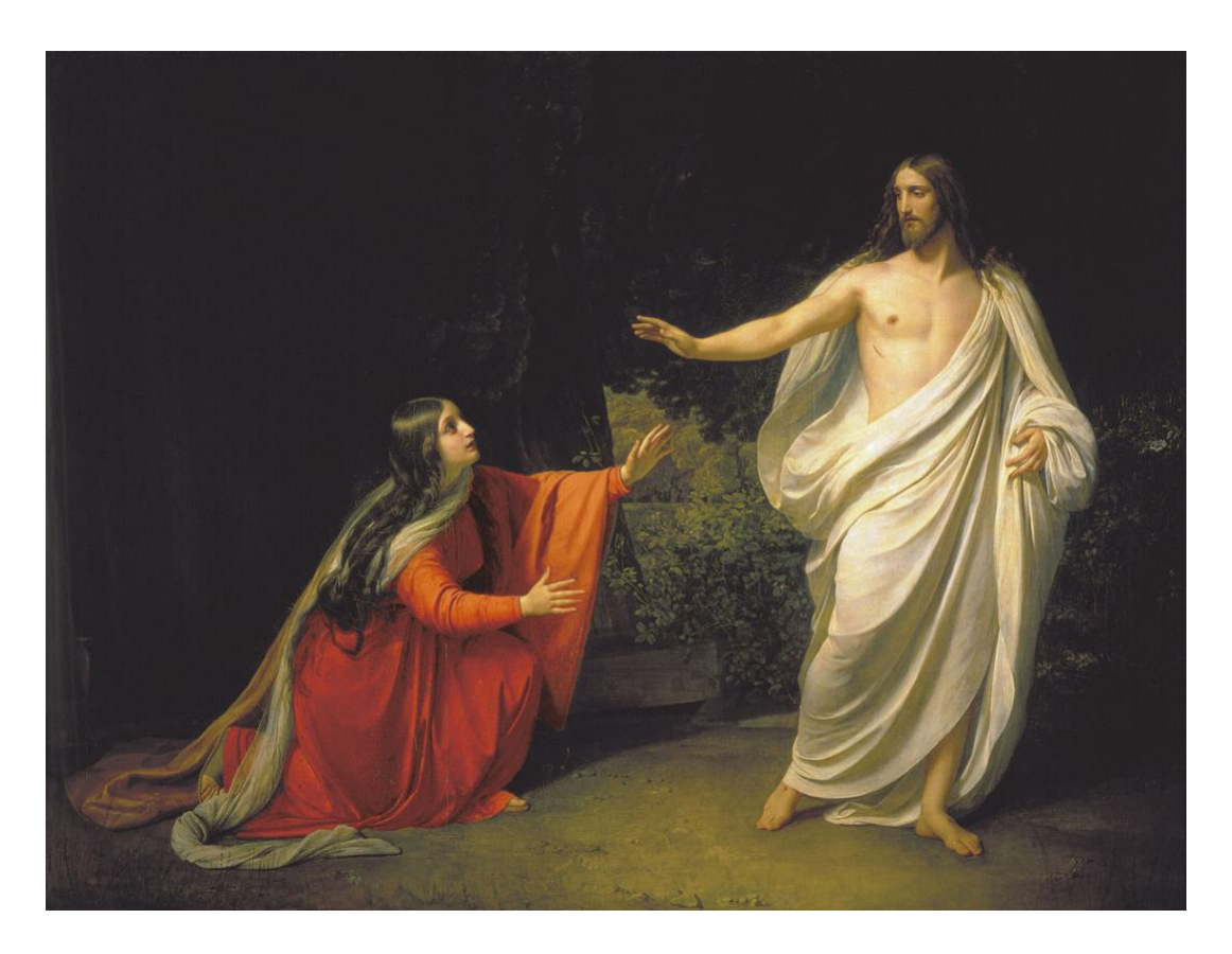
The Appearance of Christ to Mary Magdalene, Alexander Ivanov, 1835