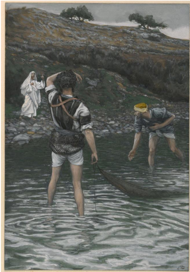
The Calling of Saint Peter and Saint Andrew, James Tissot, 1886–1894, Brooklyn Museum