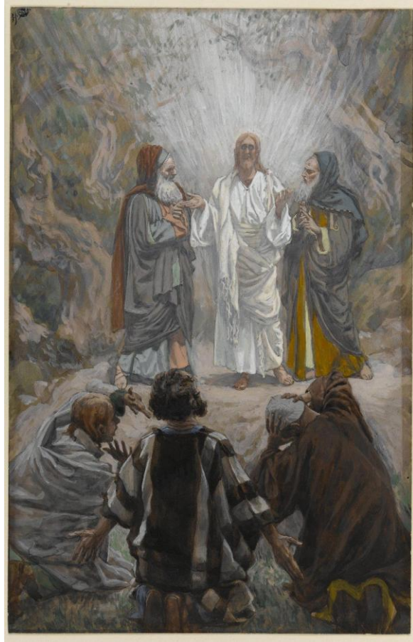
The Transfiguration (La transfiguration), 1886–1896, James Tissot